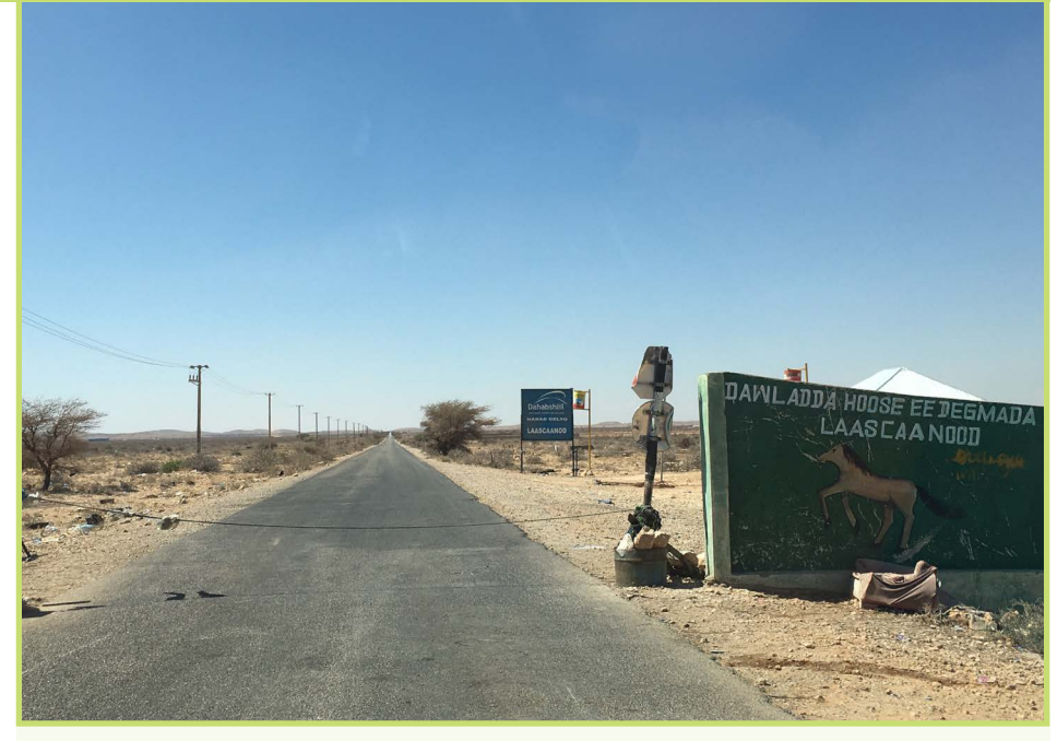
Lasanod checkpoint on the road to Berbera.

First, the contested city of Lasanod, which is located on the border between Somaliland and Puntland and is on an important trade and transport corridor that links supply chains from the Somali coastal ports of Berbera and Bosaso with the Somaliland interior. To profit in this complicated business environment, traders must negotiate multiple tax regimes in the borderlands between Somaliland and Puntland.