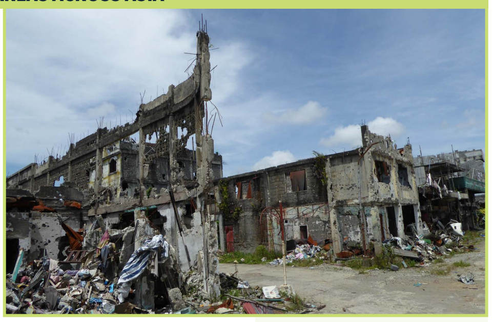
\label{eq:Destroyed buildings in Marawi, Philippines.}

At the same time, adversaries occasionally agree to negotiate peace settlements, and some national leaders have carried out political reforms to tackle the root causes of violence. Most prominently the Philippines has made steady progress on its 2014 'Comprehensive Agreement on the Bangsamoro', with the plebiscite and passage of the enabling laws in 2019 and the creation of the Bangsamoro Autonomous Region in Muslim Mindanao the same year. Peace agreements in Nepal and Indonesia also continue to hold even if developmental and conflict challenges remain.