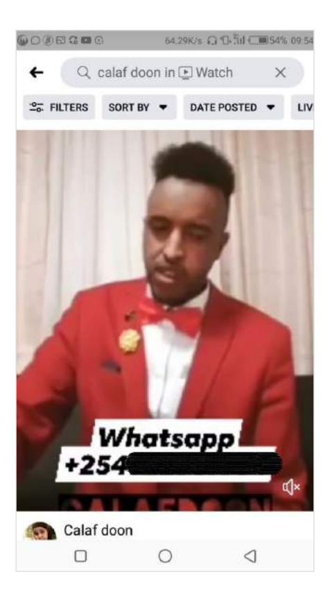
Figure 3: Live-streamed matchmaking show on social media.

He makes it like entertainment. Some take it seriously and marry each other while others take it as entertainment and joke. A friend of mine married a girl in Canada through that way, and she brought him there, and now they have kids.