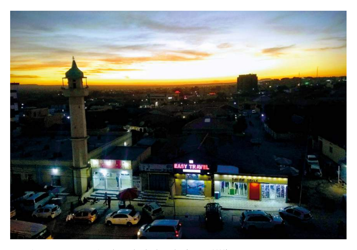
Figure 1: Western Hargeisa, photo taken by the author (January 2020)

is, if anything, particularly acute. This may be acerbated by youth dissatisfaction with the dominance of older (male) generations in a Somaliland political context otherwise often lauded for its impressive democratic credentials.<sup>6</sup>