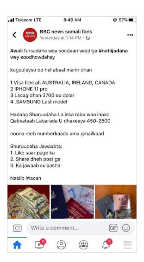
Figure 4: Purported 'competition' on Facebook asking users to like/share the post (and give their personal details) to have the opportunity to win prizes.

to misinformation or 'fake news'. Cases explored in the research also involved the (mis) use of United Nations branding,<sup>18</sup> causing potential reputational damage in a wider Somali context where its agencies remain targets for militant attacks.