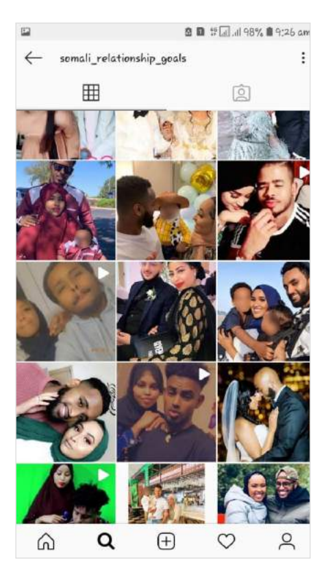
Figure 2: Screenshot taken by research participant of Instagram content (January 2020)

Screenshots shared by participants prompted the group to discuss types of social media content flowing from the diaspora and influencing young people's perceptions of life abroad. While participants acknowledged the tendency of social media users to curate positive online self-images, the power of visual media emanating from the diaspora nevertheless became apparent in discussions on the topic, as this exchange about an Instagram image (Figure 2) illustrates: