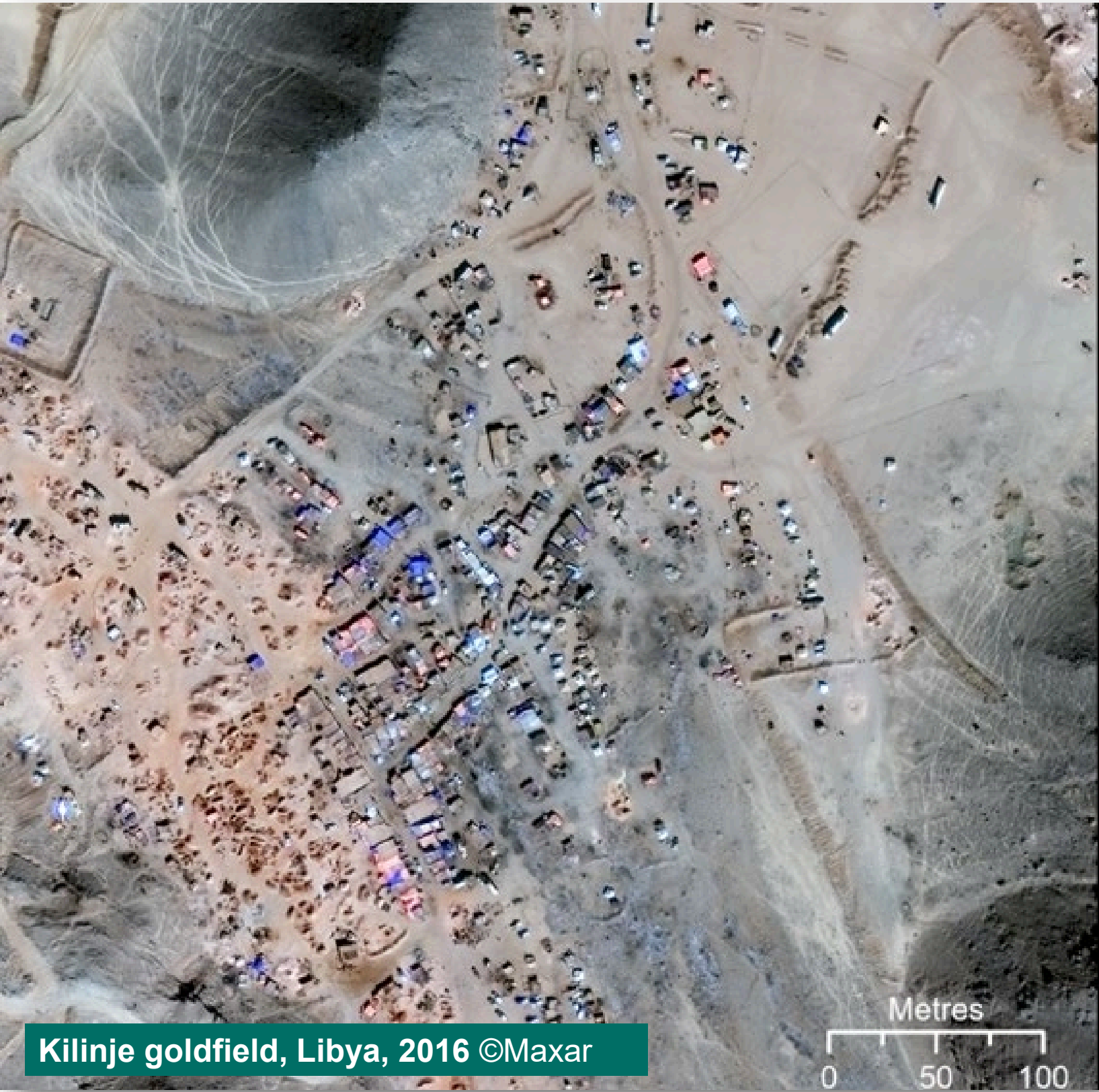
Using satellite data to analyse changes in activity of goldfields in Libya