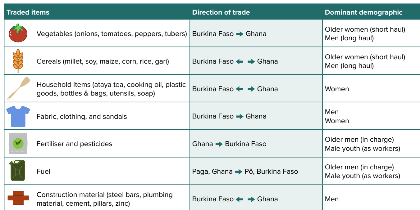
Table 1. Trade flows in the Hamile and Paga border regions 1

trade occurs inside Ghana. However, local (short-haul) and transregional (long-haul) trade along the shared Ghana–Burkina Faso border is largely confined to these trade centres that are located within 20 kilometres of border crossings.