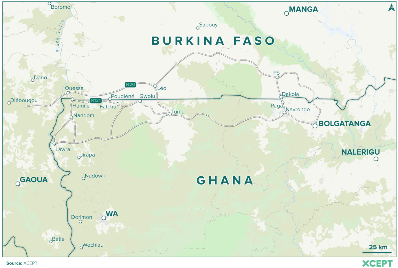
Figure 1. Map of Area 3