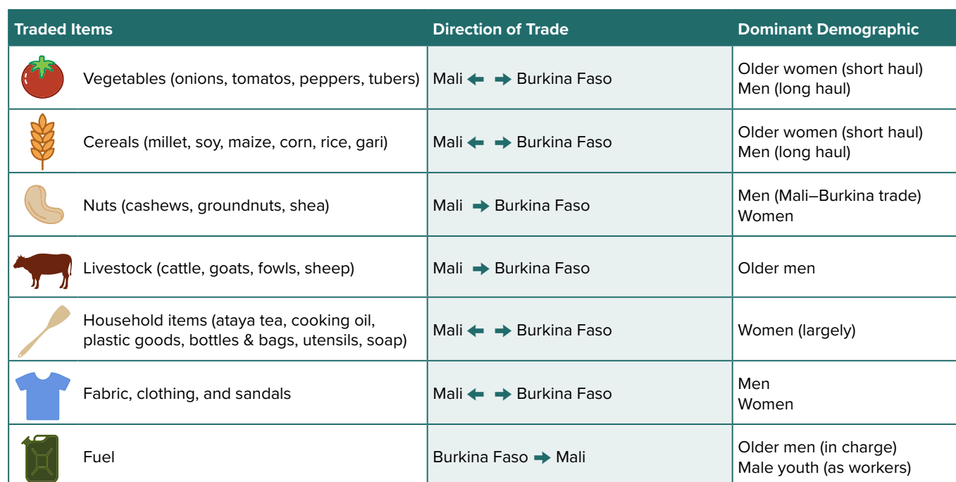
Table 1. Trade flows in the Sikasso border region 43

markets. 40 These patterns of theft occur throughout the region and involve different members of the herding economy, from herders themselves to those who watch the cattle at night, criminal groups that specialise in cattle theft, cattle merchants, and butchers. 41 The cattle trade and the related volume of traffic are important for the livelihoods of people living in the Sikasso border region given the size of herds on both sides of the border and the region's role as a local processing and reselling hub for cattle from central and northern Mali and Burkina Faso. 42