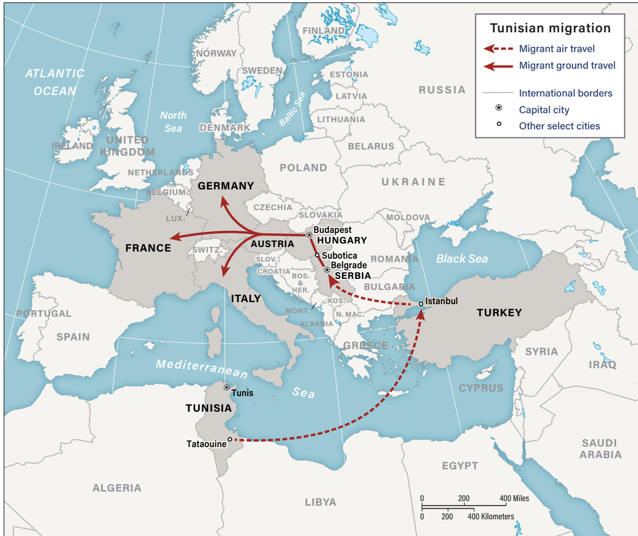
Map 1. Tunisian Migration to Europe Through the Balkans

took advantage of the initial absence of a coordinated response by European countries to exploit weak spots in pursuit of their financial, social, or geopolitical goals. 7 This is a reality the EU will have to continue to take into consideration. It suggests that merely trying to deal with the push factors of illegal migration in countries of origin may not be enough, as the pull factors in states surrounding the EU are likely to remain substantial, even if these will vary from state to state, depending on circumstances.