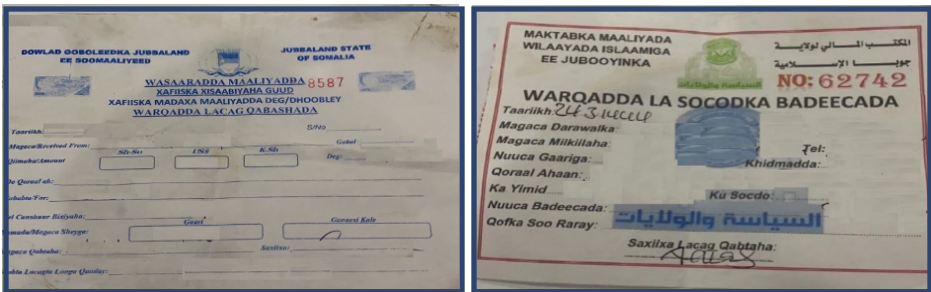
IMAGE: Checkpoint receipts (redacted) issued by the JSS (left) and al-Shabaab (right), at Dhobley and Janay Abdullah, respectively.

The al-Shabaab tax system is centralized and fixed. All transporters are taxed equally, irrespective of their clan. At the same time, the receipts issued by al-Shabaab provide road users with leeway to travel past subsequent checkpoints along the stated route, without requiring them to make additional payments (see image below). One trader verifies this: ‘The permit issued in Jubaland along the Garissa corridor will allow us to transport goods without fear of paying extra money on al-Shabaab operated checkpoints.’ 40