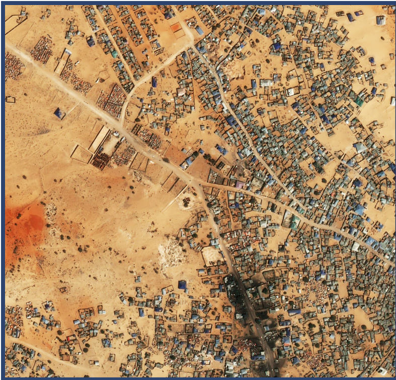
IMAGE: Satellite image of the checkpoint at the junction Via Afmadow which marks the entry point to Kismayo.

From here on, the road is substantially under Al-Shabaab control, and the next four checkpoints are operated by this group. The first al-Shabaab checkpoint a truck encounters is Berhani (or Beerxani in Somali spelling), 35 km from Via Afmadow. Yet it is fifteen kilometers further at Janay Abdallah (Somali: Jana Cabdalle) that al-Shabaab has its main tax collection checkpoint. This is an obligatory passage point for all traffic from the coast that wishes to exit in the direction