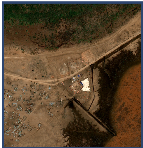
IMAGE: Areal view of the checkpoint at Baar Sanguuni.

Kismayo is a large population centre that lies close to the fertile agricultural areas of the Juba River, which supplies the city and its environs with fresh vegetables and fruits. The relatively small distance between farm and market—often no more than 100 km—is a battleground for the profits that can be made from marketing agricultural produce. In particular, it is home to frequent skirmishes between al-Shabaab and government-allied militias. Both groups compete for control over passage points along the transport routes to export agricultural produce rather than for control over farming areas because the margins are higher for transport and marketing compared to those for production. The checkpoints along the route from Jamaame to Kismayo are listed in Table 6 (also see map on page 16). This provides insight into the double taxation of agricultural produce and the resulting marginalization of small-scale farmers.