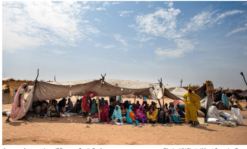
A group of women in an IDP camp, South Darfur