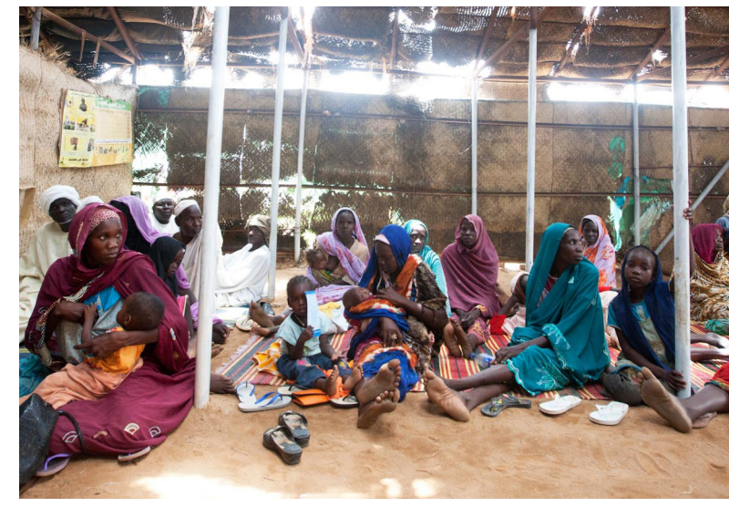
Displaced residents return to Darfur camp after looting and violence

On yet another parallel track, in May 2024, Egypt hosted a conference of various political parties and armed groups backing SAF. This resulted in a unified platform called the